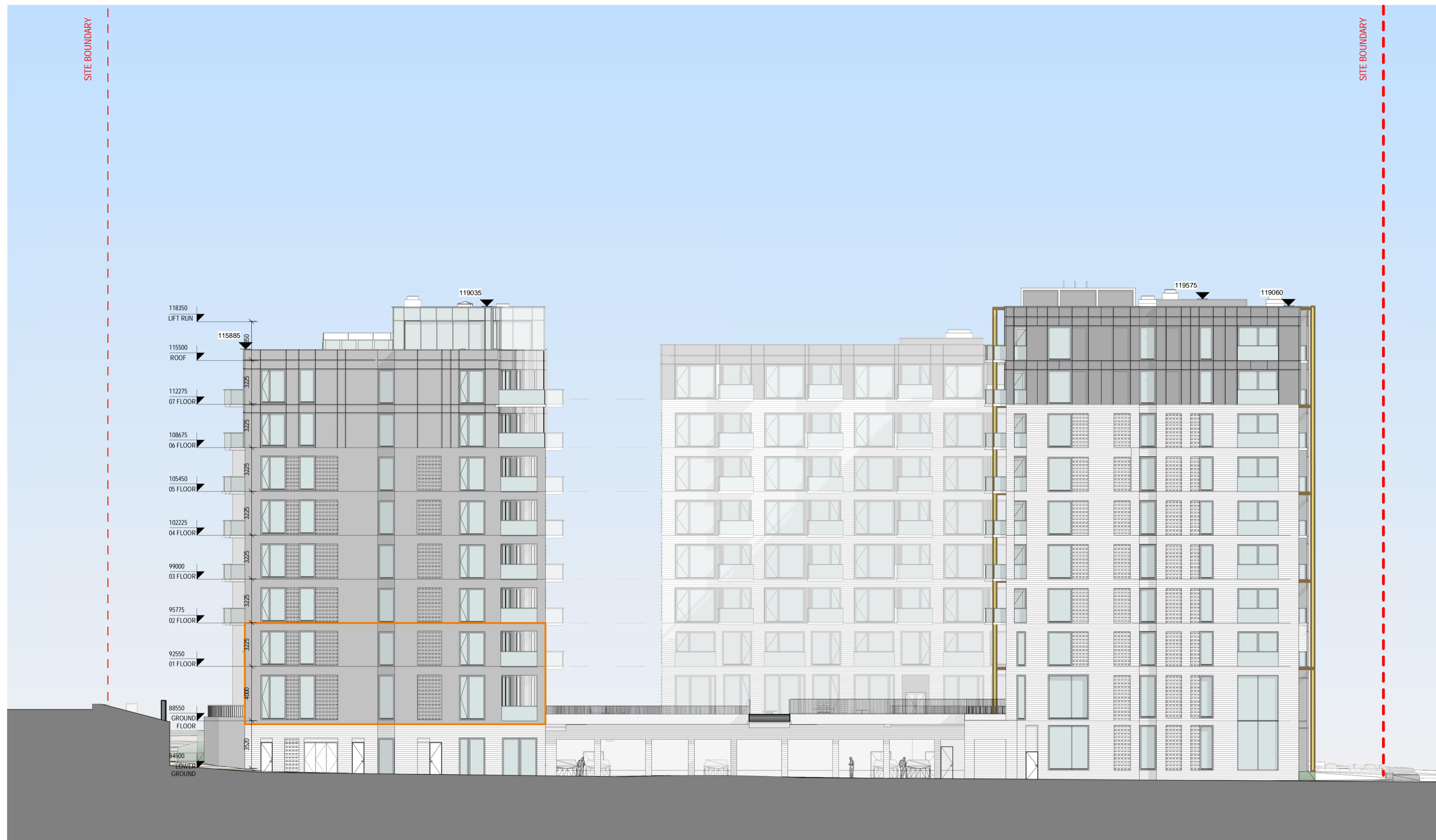
① PROPOSED COURTYARD ELEVATION 04 - TACK SITE Scale: 1 : 200